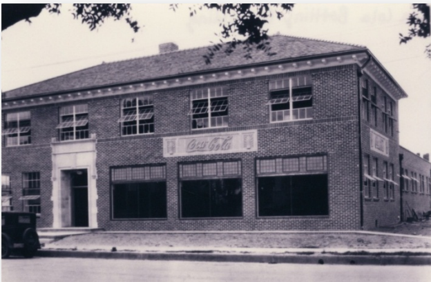
In 1930, Lake Charles Coca-Cola Bottling Company opened a new facility on 408 Lawrence St.