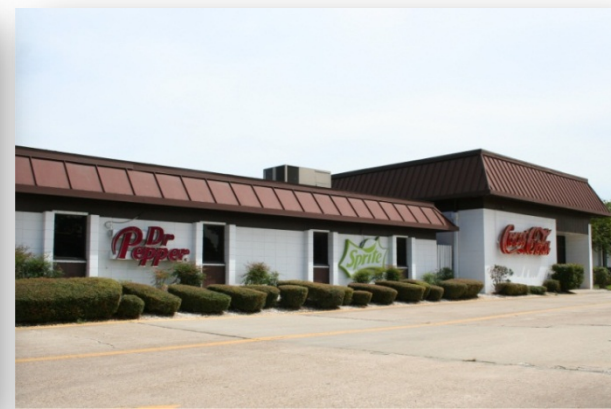
Lake Charles Coca-Cola Bottling Company 1970 - Today 2401 Hwy. 14 Lake Charles, Louisiana