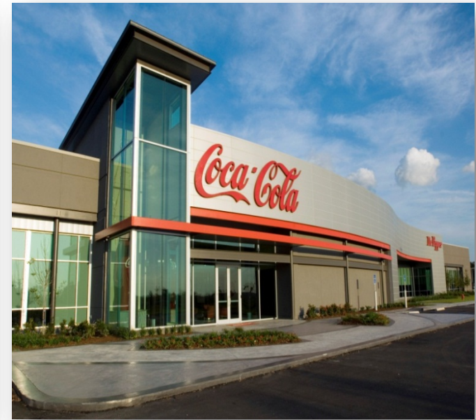
Baton Rouge Coca-Cola's Current Facility Located at 9696 Plank Road