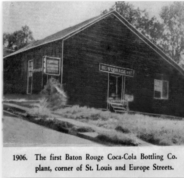
1906. The first Baton Rouge Coca-Cola Bottling Co. plant, corner of St. Louis and Europe Streets.